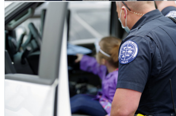
Moon Township Police Officers recently participated in a bike giveaway at Earth Day for Moon Township